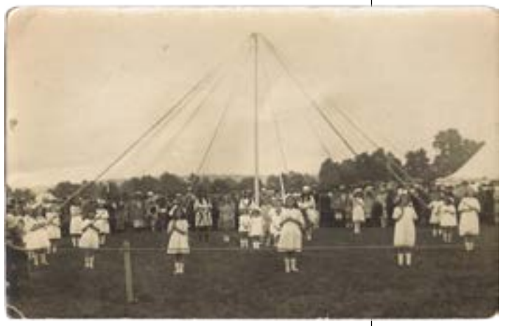
Celebrating May Day c1900 in the field commonly used for large exhibitions and events, such as the flower show in this accompanying article

Prince and Princess of Wales! "whilst further on, even after we had passed over the bridge on our way to Devizes, the road was lined with fir trees and decorated with flowers and evergreens. In short, to give a description of all the decorations, would to mention nearly every house in the town; for there was