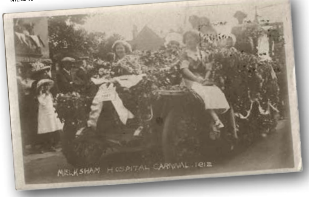
28 September, 1912