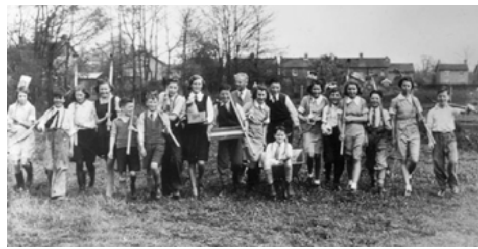
St. Michael's School headmaster and pupils Dig for Victory in April, 1940.