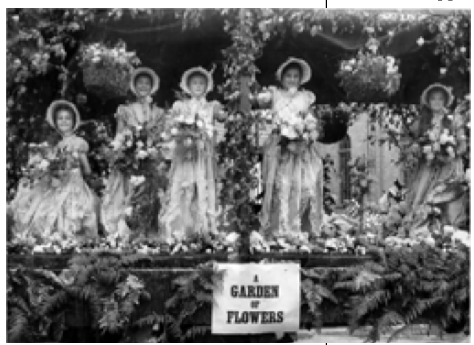
Melksham's pride of its flowers carries on. from Floral Fete Melksham, through to this carnival entry c1950, and no doubt well into the futre.

But while the tents were crowded with admirers inside, there was no lack of amusement without, and certainly no lack of company to enjoy the gay scene that was going on around them. The families of nearly all the gentry in the neighbourhood were there, including